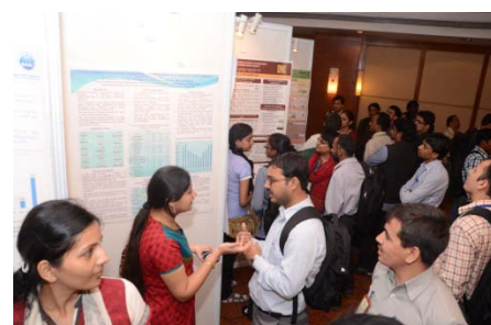
Participants viewing the research posters