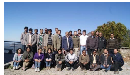
GVAX Research Group at ARIES, Nainital