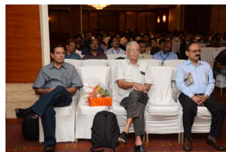
Dignitaries at the inaugural session